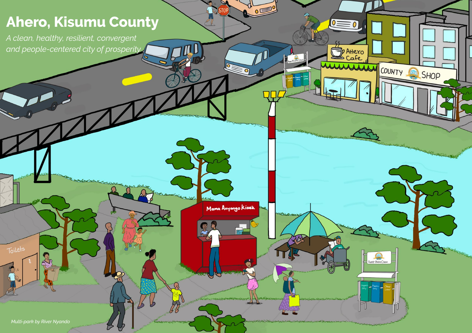
Multi-park by River Nyando

A clean, healthy, resilient, convergent and people-centered city of prosperity.