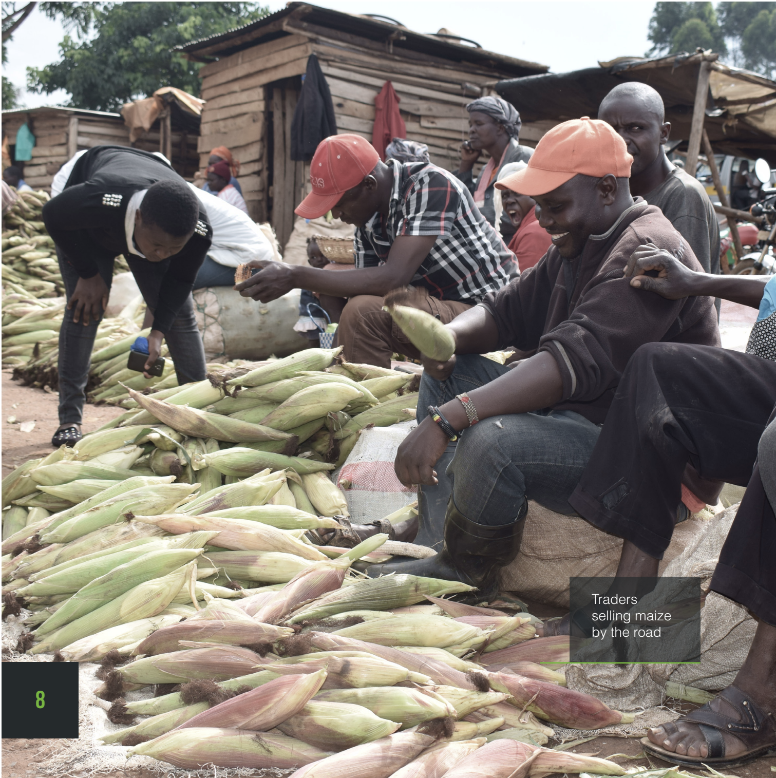
Traders selling maize by the road