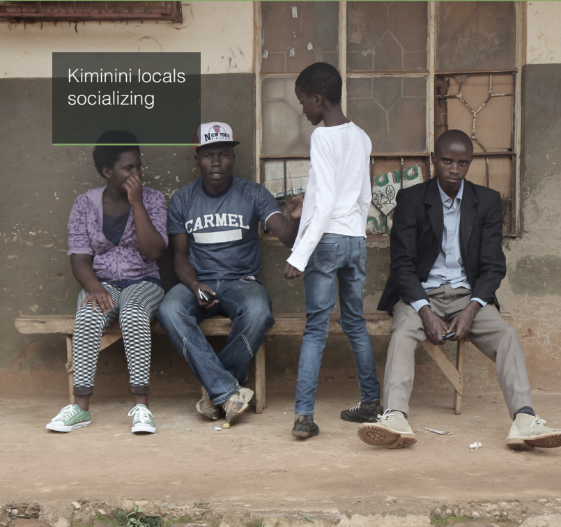
Kiminini locals socializing