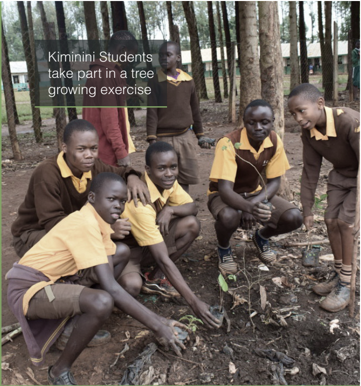
Kiminini Students take part in a tree growing exercise