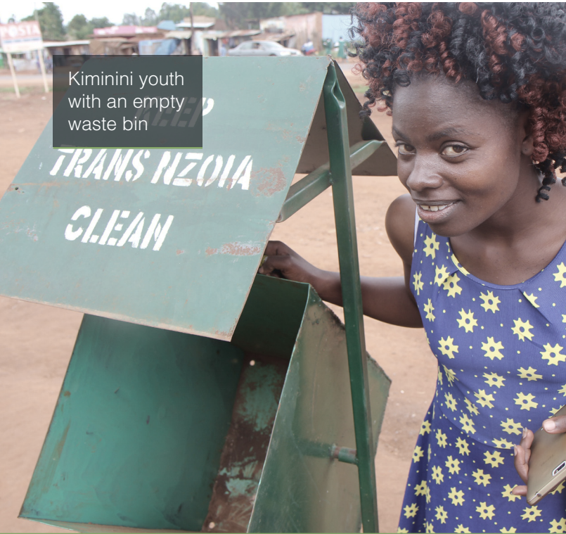
Kiminini youth with an empty waste bin