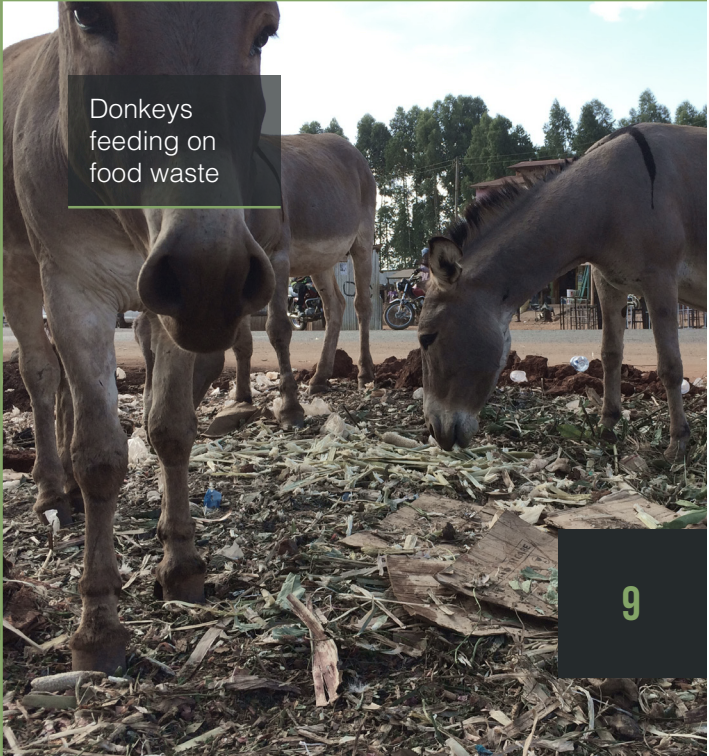
Donkeys feeding on food waste