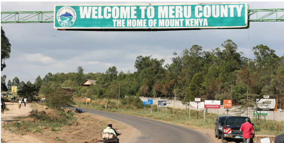
Gateway to Meru