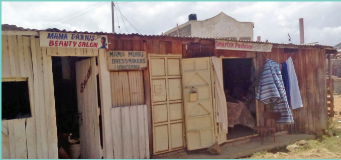
Some of the operational kiosks in Makutano Market