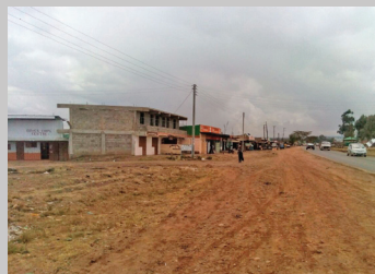
Katheri entrance from Likii-Makutano

The residents have widely discussed names for the town, but can't settle