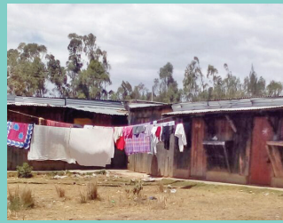
Likii - Makutano Market