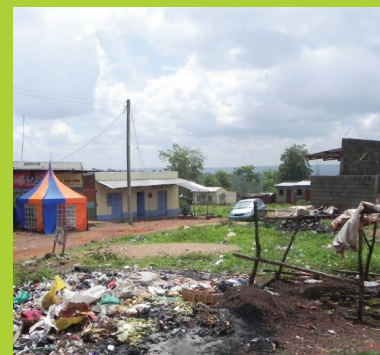
A garbage dump site in Kwa Vonza Town

With this level of organization, there is hope that Kwa Vonza will rise in strength to become a new town that draws the admiration of all, and presents a rich basis for future learning.