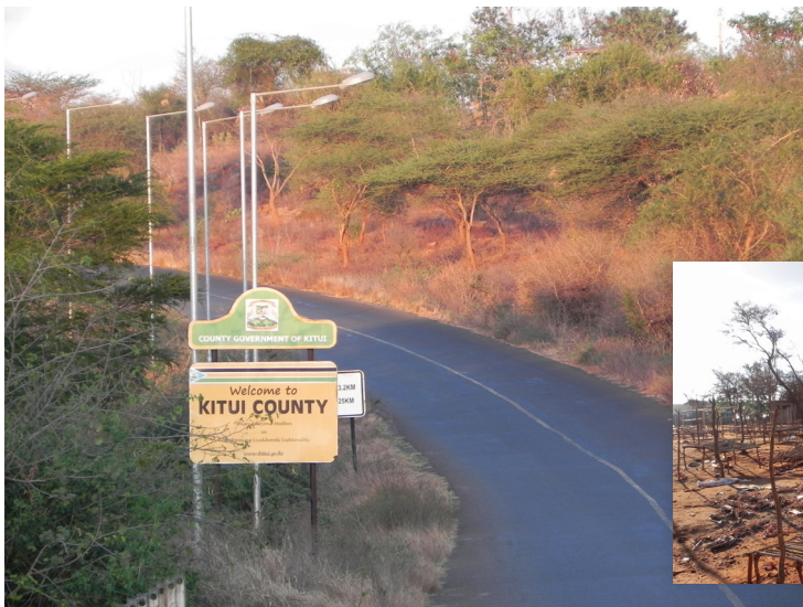
"Welcome to Kitui County!"

Because of the influence of the students, methods of stakeholder engagements with the working group are varied and progressive. These include face-to-face meetings, site visits, telephone calls, and small group discussions, which are so far effective in keeping the processes on course. From the stakeholder discussions on the challenges facing the town, the Urban Sustainability Review for KwaVonza Town will soon be released.