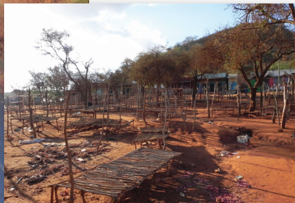
Kwa Vonza Open-air Market