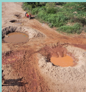
Unhygienic source of water in the outskirts of Kwa Vonza Town

Having decided that images were the best, quickest and most memorable way to demonstrate the challenges and possibilities that they face, Kwa Vonza Town Community got into action. The SymbioCity Kenya Programme team in Kitui County collaborated with SEKU University students to take photographs and use base maps to raise the issues affecting the town. The survey that was carried out between February 22 and 25, helped to build the capacity of the community, and increase their participation in the town's activities.