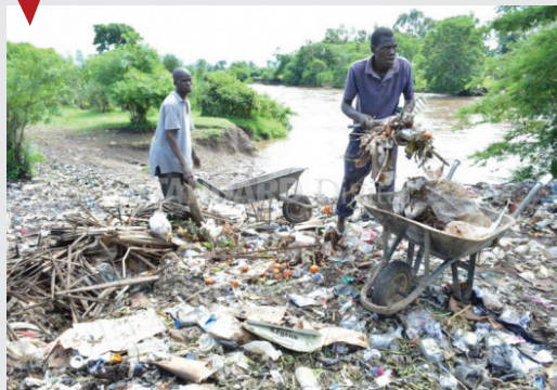
A section of polluted River Nyando