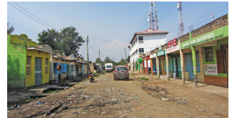
Ahero Town’s urbanisation poses a challenge to urban services such as waste management.

Kisumu County has made tremendous strides in its collaborative work approach, with a solid and active working group. Through continuous stakeholder consultations and engagements, the county has developed objectives, strategies and an urban vision that fits within the framework of its vision.